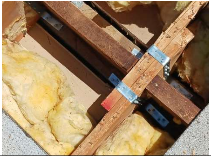
Roof To Wall Connection