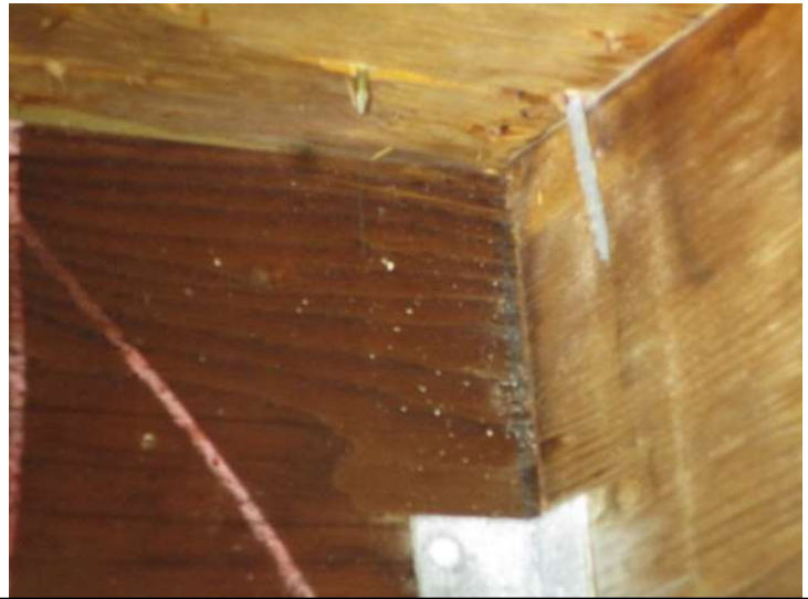
Roof Deck Fastener Size