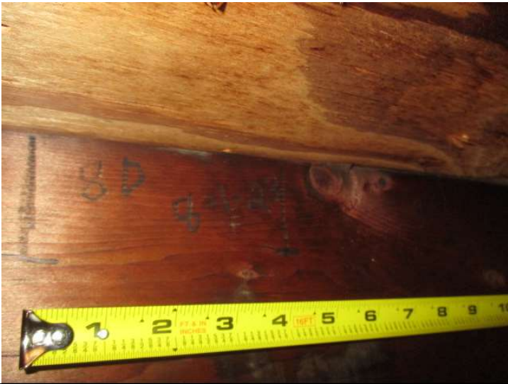
Roof Deck Fastener Spacing