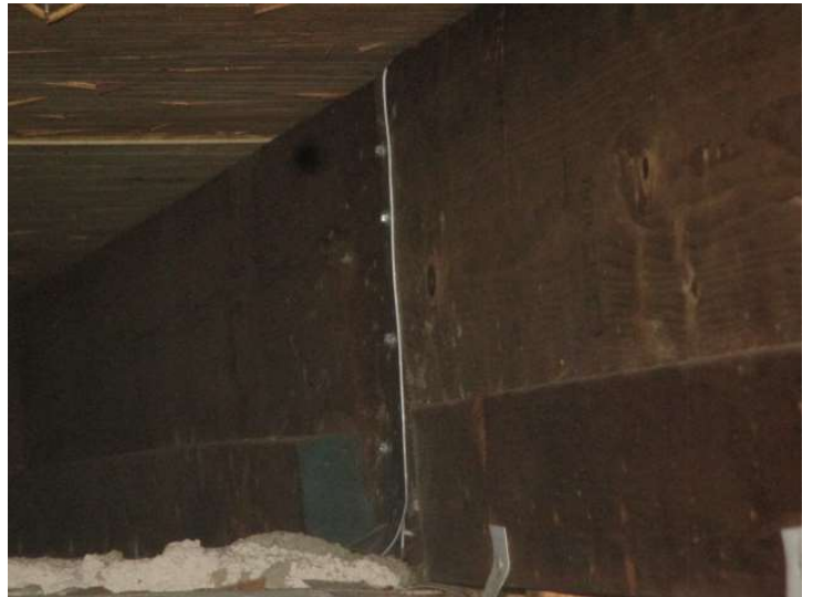
Roof To Wall Connection