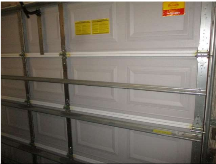
Exterior Opening Protection