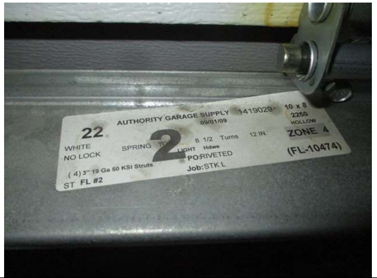
Exterior Opening Protection