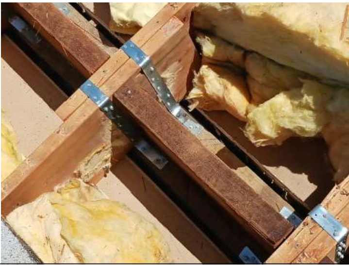
Roof To Wall Connection