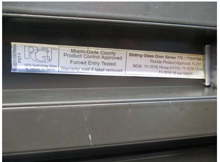
Exterior Opening Protection