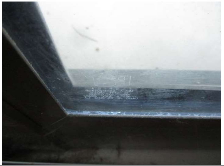
Exterior Opening Protection