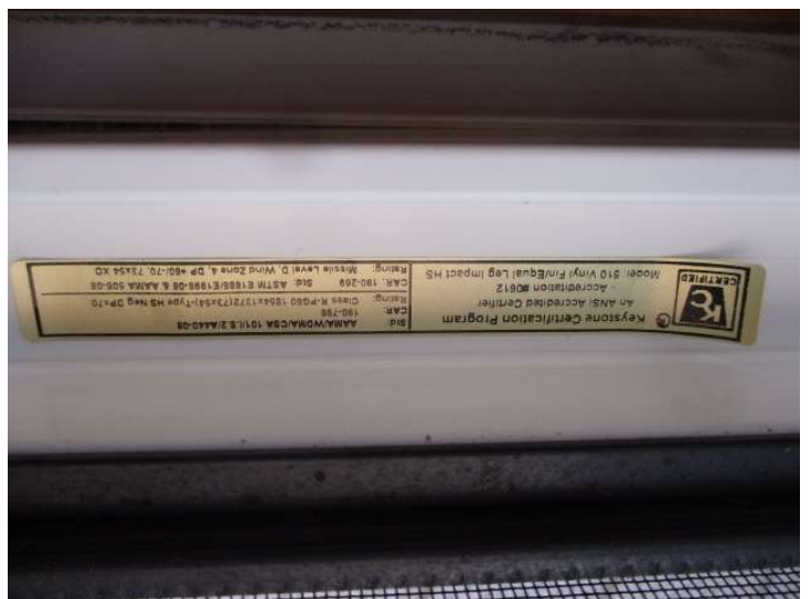
Exterior Opening Protection