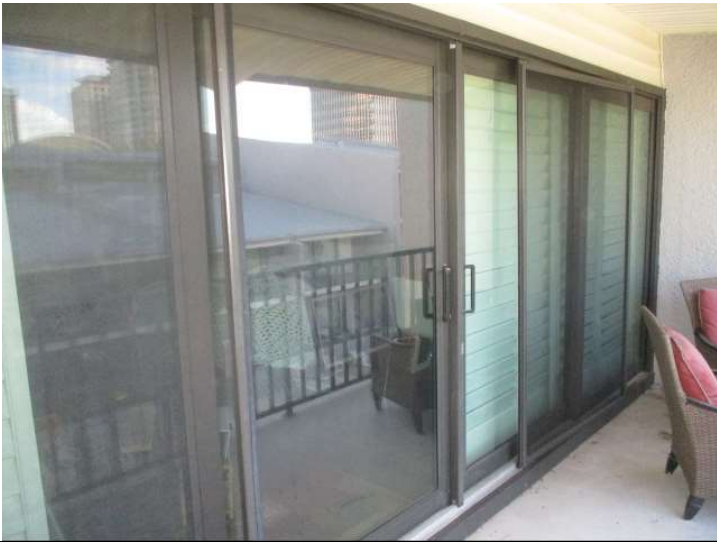
Exterior Opening Protection