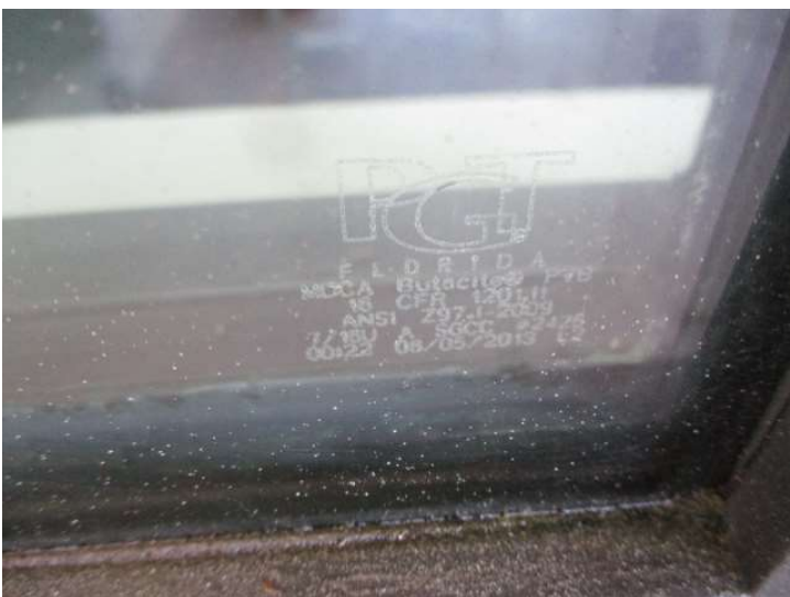
Exterior Opening Protection