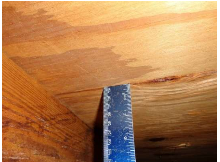
Roof Deck Thickness