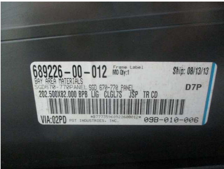
Exterior Opening Protection