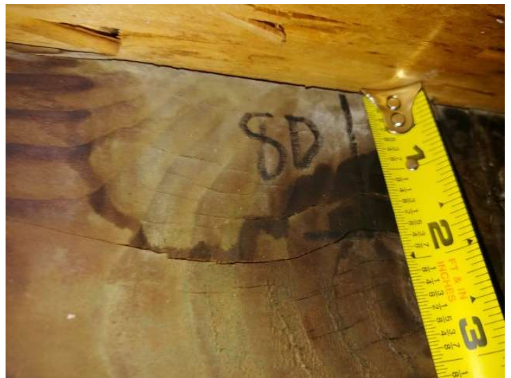
Roof Deck Fastener Size