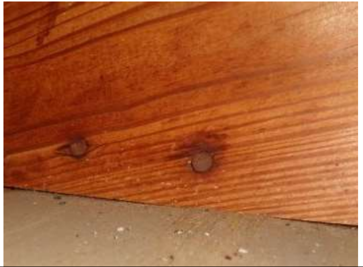
Roof To Wall Connection