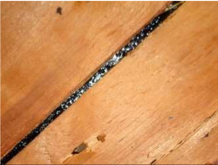
Secondary Water Resistance