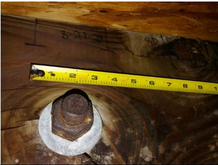
Roof Deck Fastener Spacing