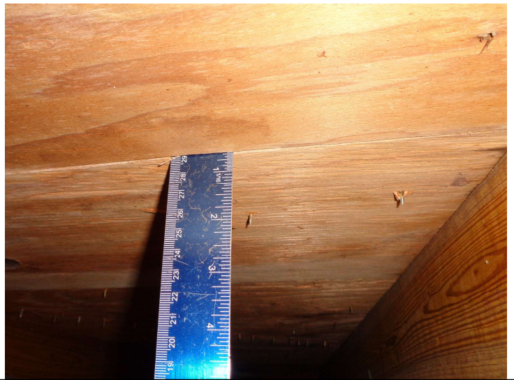
Roof Deck Thickness