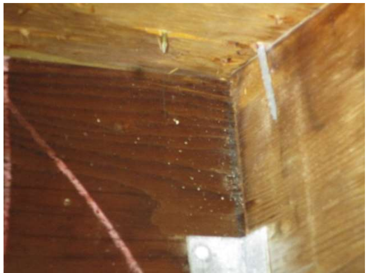
Roof Deck Fastener Size