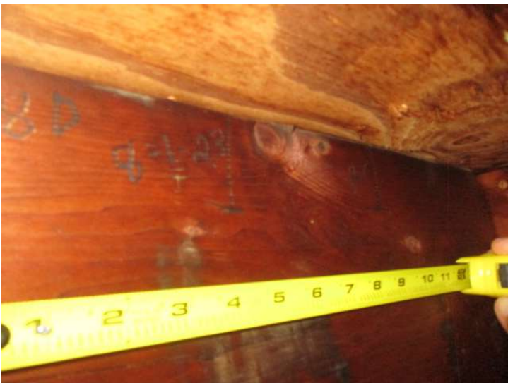
Roof Deck Fastener Spacing