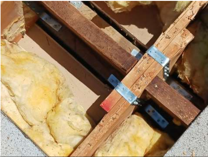
Roof To Wall Connection