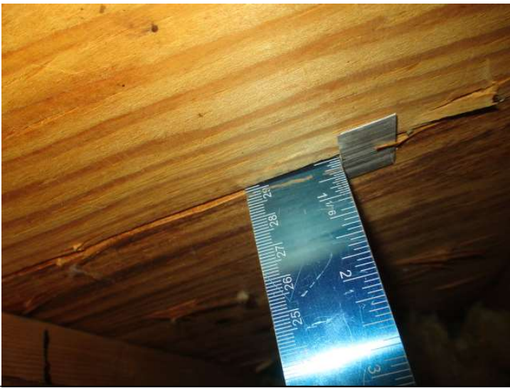
Roof Deck Thickness