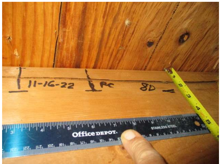
Roof Deck Fastener Spacing