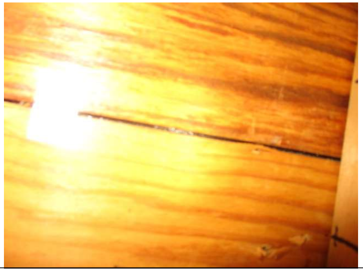
Secondary Water Resistance