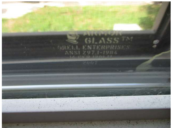
Exterior Opening Protection