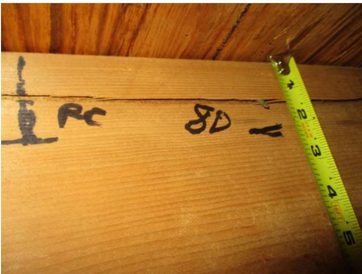
Roof Deck Fastener Size