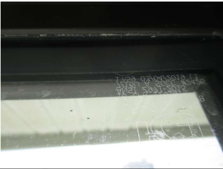
Exterior Opening Protection