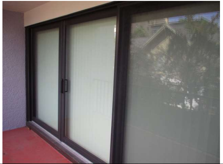
Exterior Opening Protection