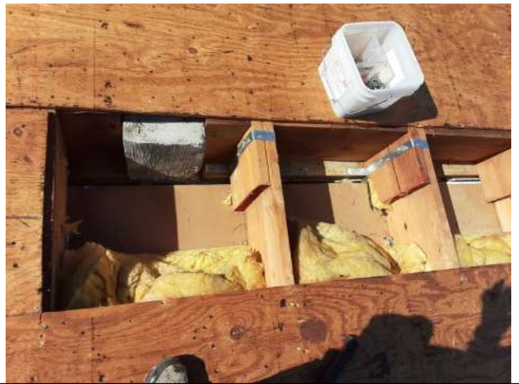
Roof To Wall Connection