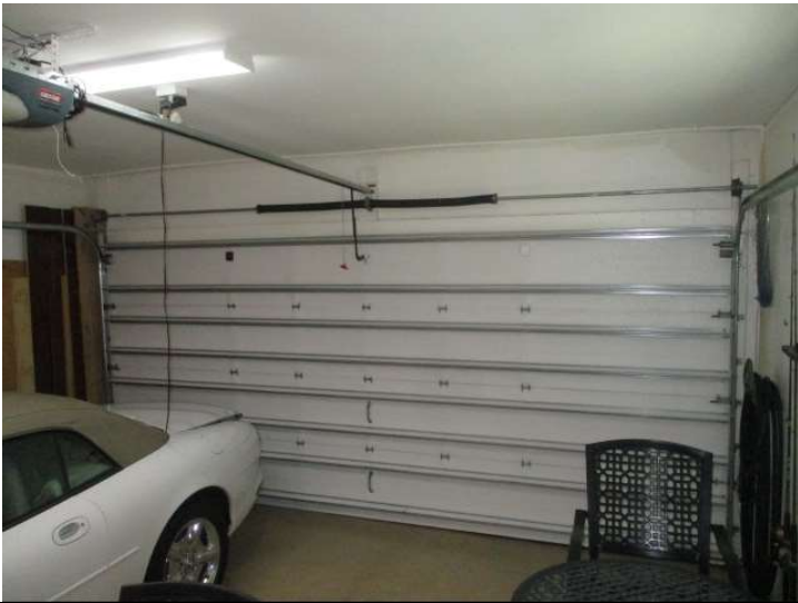
Exterior Opening Protection