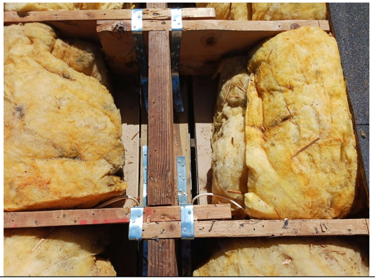
Roof To Wall Connection