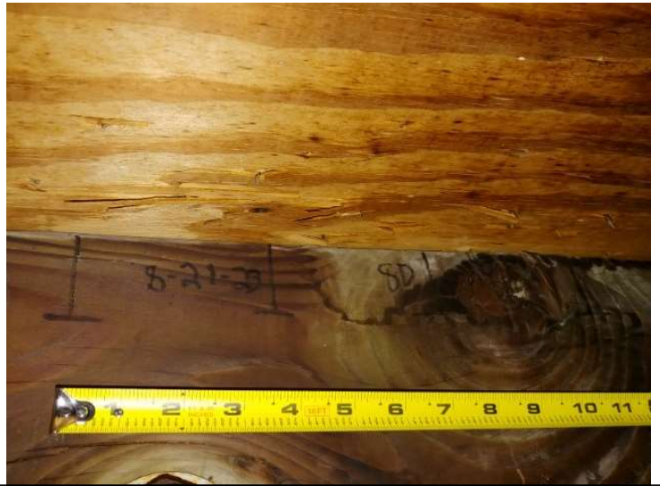
Roof Deck Fastener Spacing