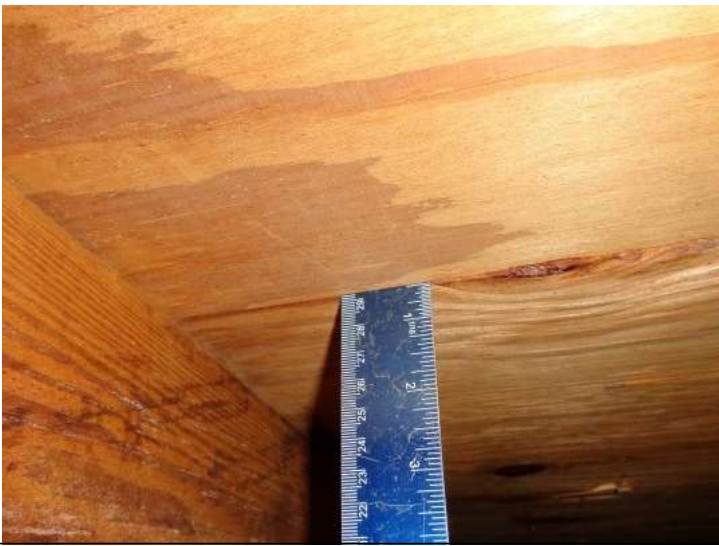
Roof Deck Thickness