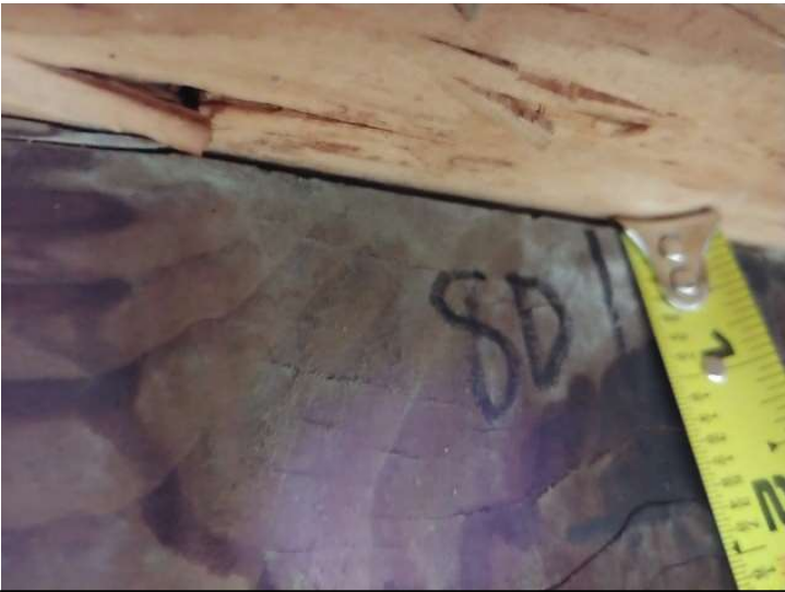
Roof Deck Fastener Size