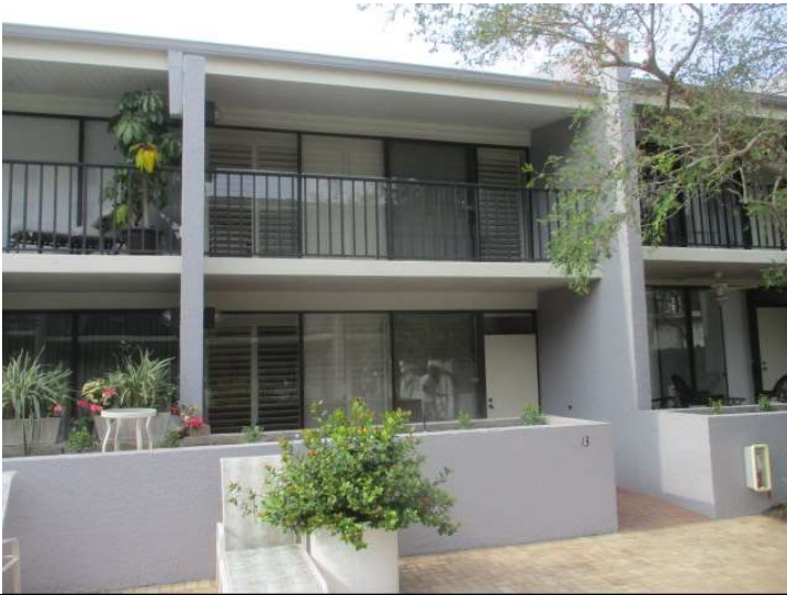
Rear Elevation Unit 13