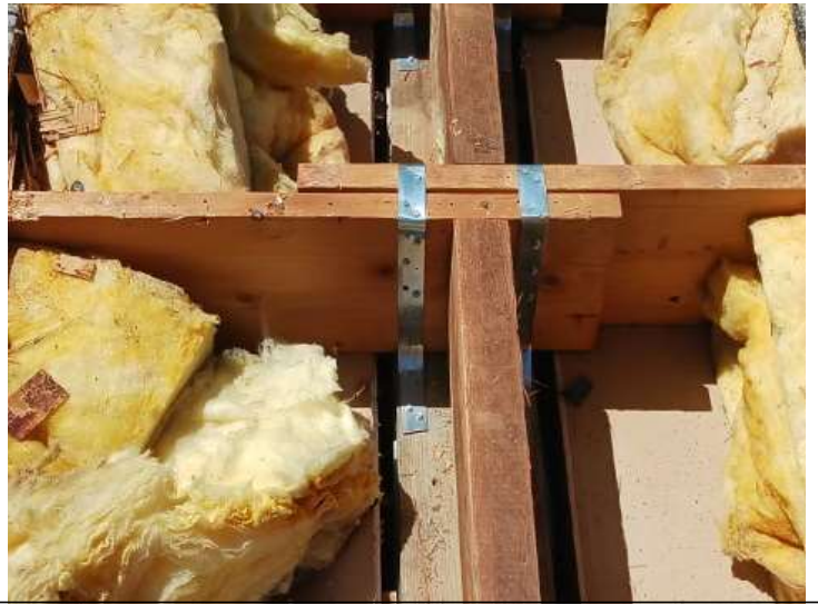
Secondary Water Resistance