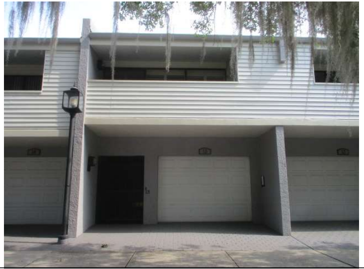
Front Elevation Unit 13