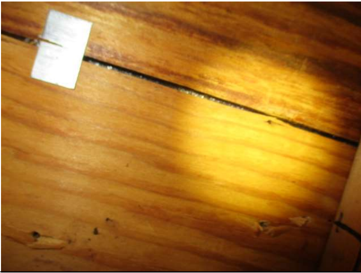
Secondary Water Resistance