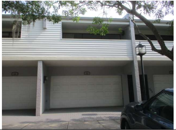
Front Elevation Unit 12