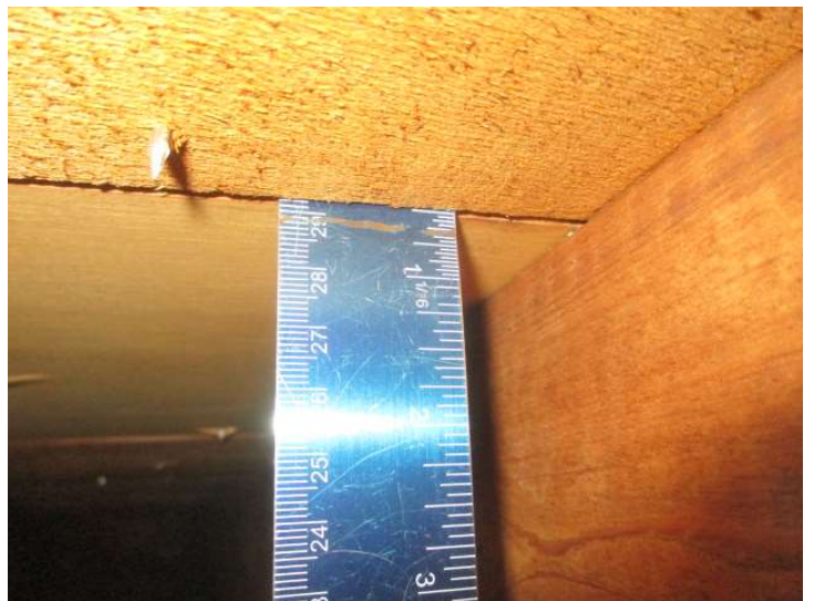
Roof Deck Thickness