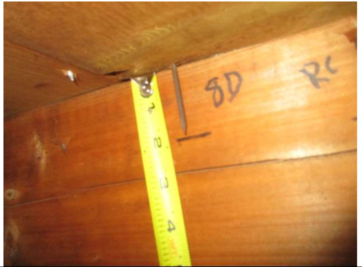
Roof Deck Fastener Size