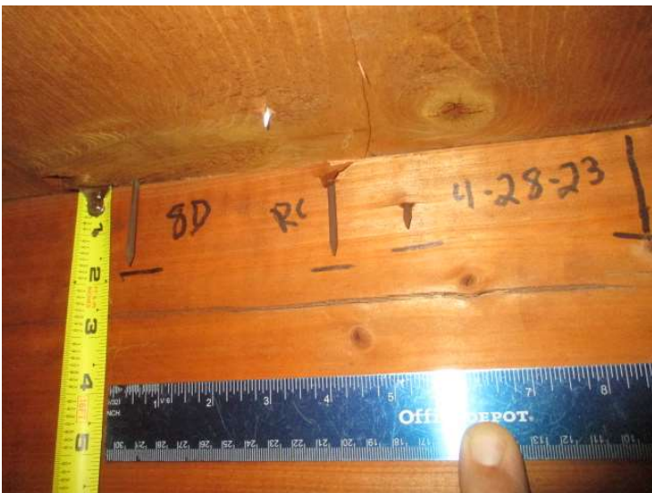
Roof Deck Fastener Spacing