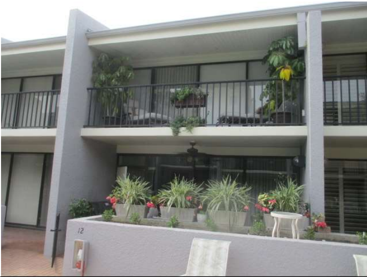
Rear Elevation unit 12