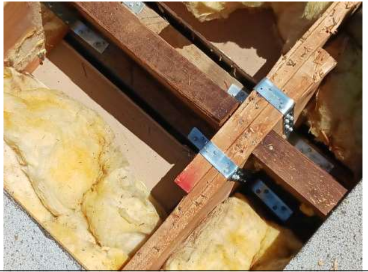
Roof To Wall Connection