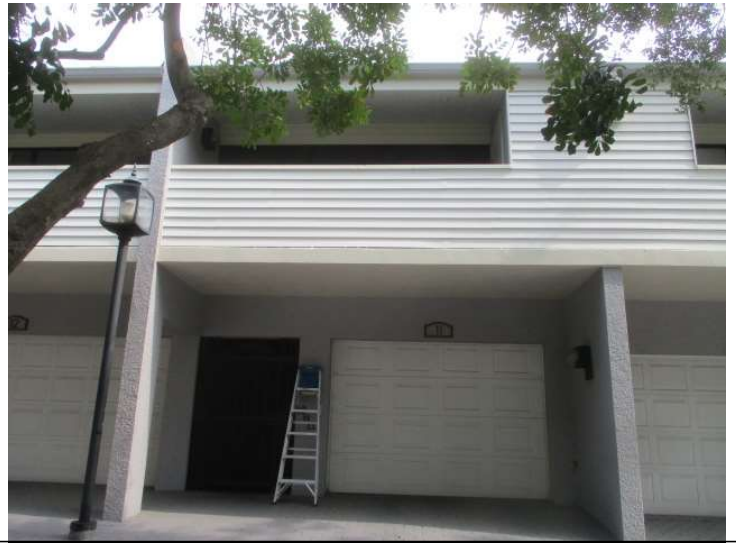
Front Elevation unit 11