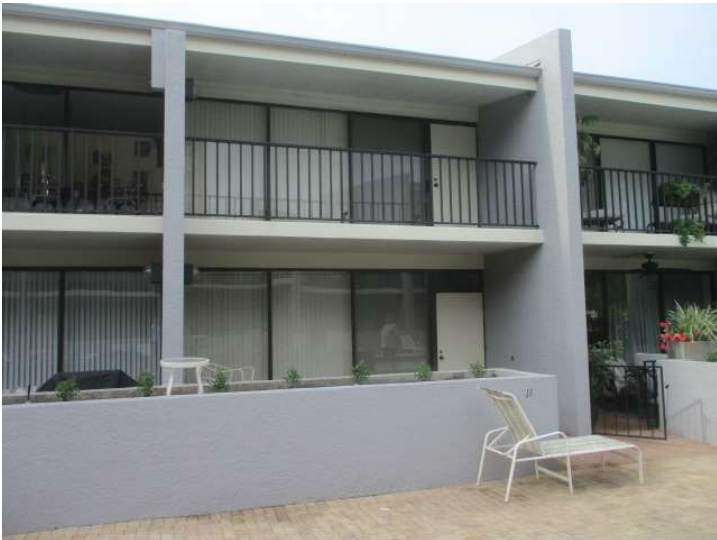
Rear Elevation Unit 11