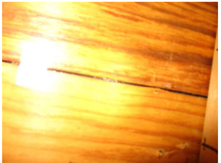
Secondary Water Resistance