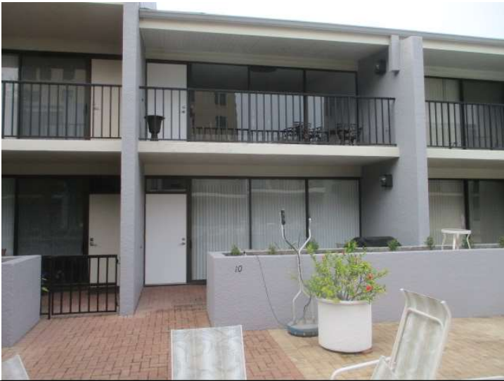
Rear Elevation unit 10