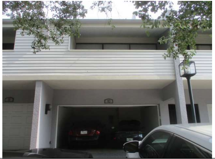
Front Elevation unit 10