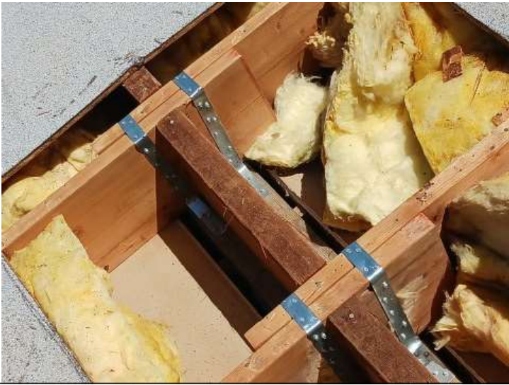
Roof To Wall Connection