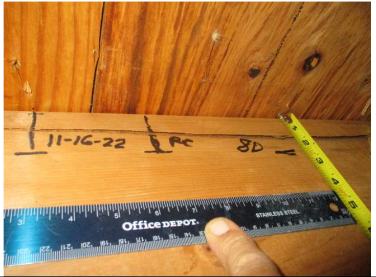
Roof Deck Fastener Spacing