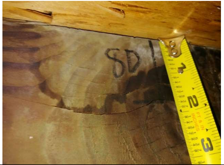
Roof Deck Fastener Size