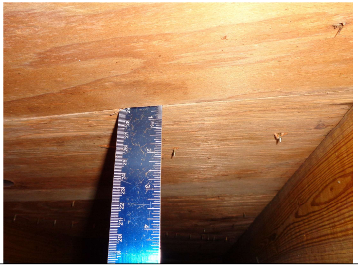
Roof Deck Thickness